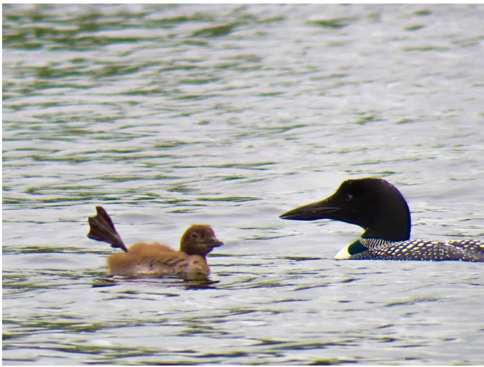
Photo of Loon chick